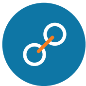
Enterprise Content Management Integration