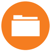
Track Files & Boxes