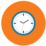
Retention Schedule & Legal Holds Management