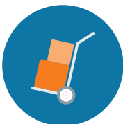
Off-Site Storage Provider Integration