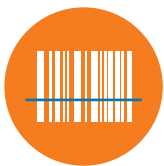
Integrated Barcode & RFID Technology