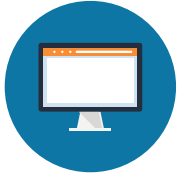
Digital Content Management